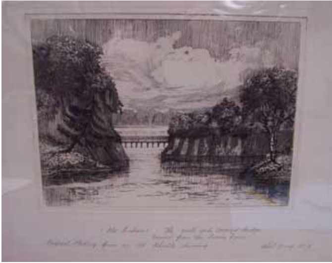
Covered Bridge on the North Side, crossing the Mohawk between Cohoes and Waterford. The earliest bridge at this location dates from 1795.