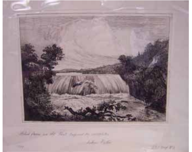
The Cohoes Falls.